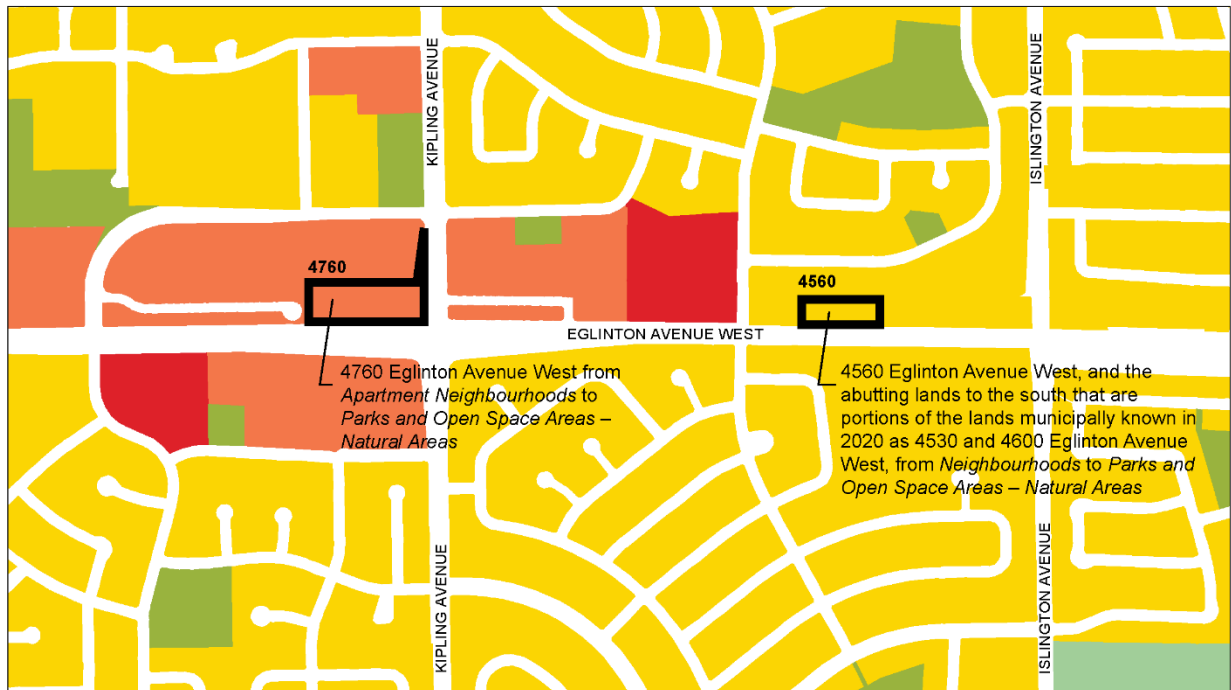
4530, 4560, 4600 and 4760 Eglinton Avenue West

TORONTO Official Plan Land Use Map #14 Amendment No. 515